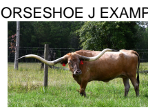
HORSESHOE J EXAMPLE