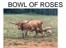
BOWL OF ROSES