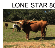
LONE STAR 80