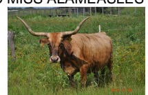
P C MISS ALAMEASLES 2000